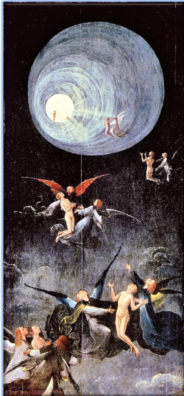
„Ascent of the Blessed“ by Hieronymus Bosch

Apart from the various shells in which the human spirit is concealed, the human being still possesses a special, imperishable charisma, a spiritual garment, which is called an aura. It envelops the whole human being in an ovoid egg shape. As spirituality increases, the sun aura gradually forms, the so-called halo, which surrounds the brain centres. The aura is directly dependent on the level of spiritual development of the human being. The more highly