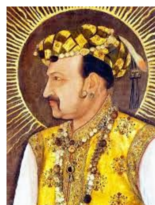
Akbar the Great