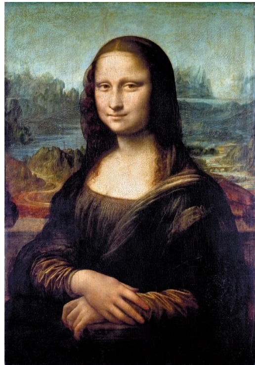
Mona Lisa, by Leonardo da Vinci

A student on the spiritual path must learn and perfect all arts, because in order to attain the stage of a master of wisdom, it is necessary to achieve the greatest possible perfection in all fields of art and