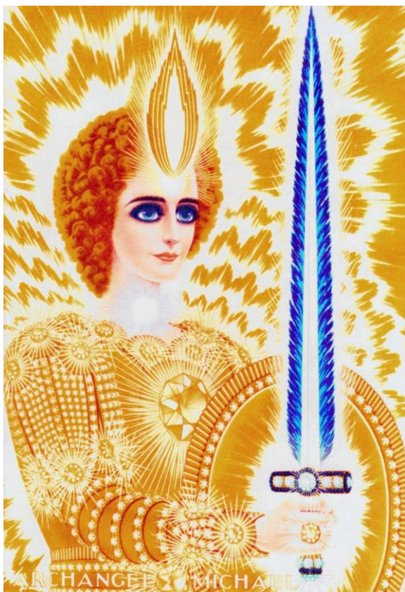
MAITRY – Archangel MICHAEL

It is self-evident that a commander appears at the front only when the need of his soldiers is greatest and his presence becomes absolutely necessary. For this reason, the appearance of Master MORYA, the prophesied Avatar of Synthesis, was planned by the leadership of the Hierarchy of Light only for the Age of Aquarius, when the Battle of Harmagedon reaches its climax and comes to an end. However, MORYA will not come in a physically incarnated state, for a physical rebirth is currently not intended for Him or for CHRIST JESUS.